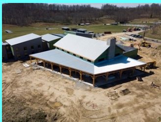
Pigott Dining Hall

Fees include daily meals (exception for dinner on Monday and breakfast Friday), daily snacks and drinks, and course materials. Early arrival and late departure accommodations are available, additional fees apply.